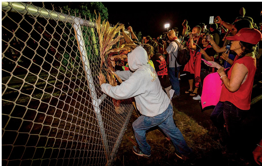
One of Haleakalā's ahu , or shrines, with Hawaii Island faintly visible in the distance (top). In 2015, protesters on Maui (bottom) disrupted the delivery of materials to Haleakalā to build the DKIST.

with science education. "There was real dialogue that took place," he says. Making a good faith effort to address Native Hawaiian concerns led to real compromise and understanding on both sides, he says.